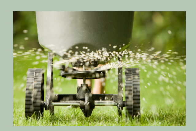
Wait until <u>after last freeze</u>, if pre-emergent contains fertilizer