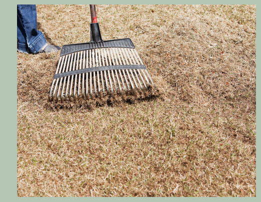
* Thatch is the intermingled layer of living and dead organic matter that develops between the live green grass and the soil surface.

Aerators, power rakes, or even manual raking will de-thatch, if there is an excessive thatch accumulation (greater than 1/2-inch thick)