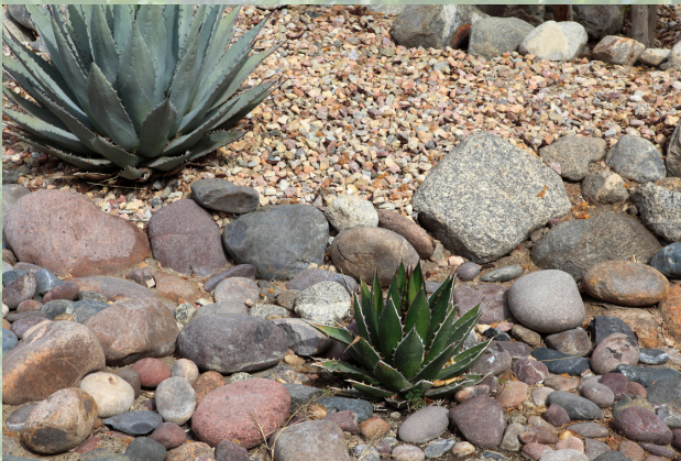
drier more desert area

While xeriscaping means different things to different people and its implementation varies from person to person and place to place it is actually an amazing concept.