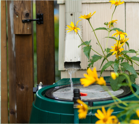
Rain barrel utilized as an irrigation source

By utilizing your rain barrels or other methods of harvesting rainwater, you can irrigate your Xeriscape design