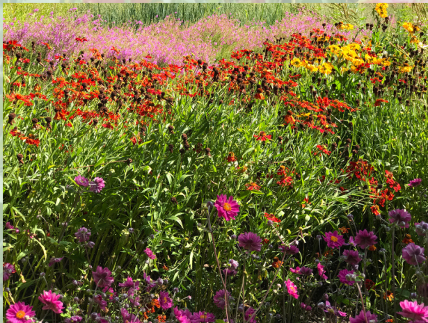
more tropical area