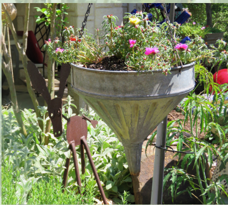
Funnel utilized within a Texas Xeriscape