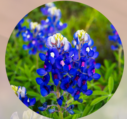
A Lady Bird Johnson Royal Blue Bluebonnet