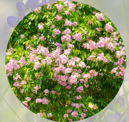
TLagerstromia Basham Party Pink